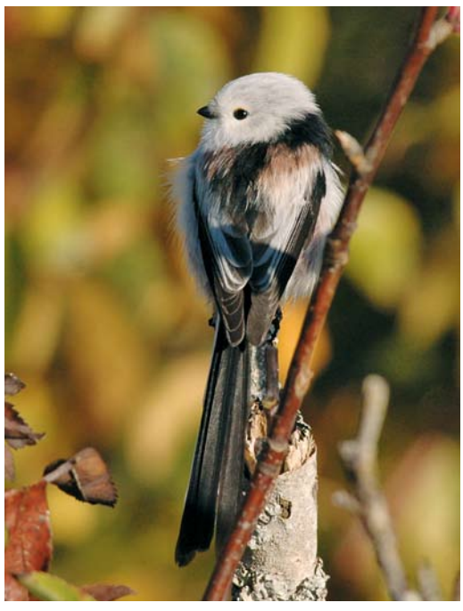
363 White-headed Long-tailed Bushtit / Witkopstaartmees Aegithalos caudatus caudatus , adult, Hanko, Halias, Finland, 1 October 2004. Note dark tertials.

europaeus groups, like aremoricus, macedonicus, ro-saceus and italiae , a breast-band is usually present. As many intermediate birds also lack a breast-band, it is not a reliable feature to separate caudatus .