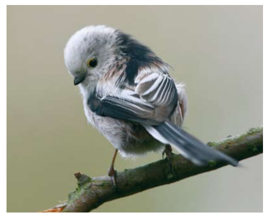
374 Central European Long-tailed Bushtit / Staartmees Aegithalos caudatus europaeus , Leiden, Zuid-Holland, Netherlands, 8 March 2007 ( Herman Berkhoudt ). Same bird as plate 372. Note whitish tertials more typical of caudatus .

Tynemouth, Northumberland, in November 1852, now at Hancock Museum (Witherby et al 1938, Galloway & Meek 1978); 2 up to six birds at Westleton Heath and Minsmere RSPB Reserve, Suffolk, from 25 January to 25 February 2004 (Small 2004); and 3 up to three birds at Lewes, Sussex, from 26 January to 17 February 2004 (Cooper et al 2004, Evans 2004). Photographs support the latter two records.