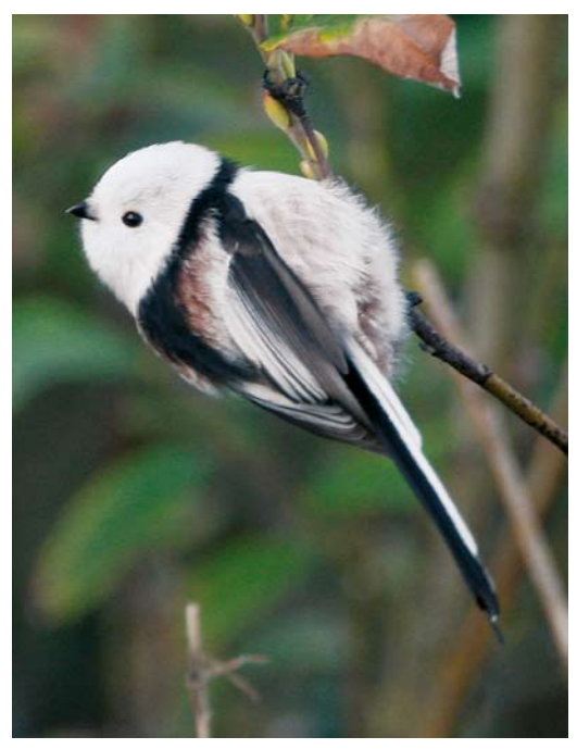
364 White-headed Long-tailed Bushtit / Witkopstaartmees Aegithalos caudatus caudatus , Helgoland, Schleswig-Holstein, Germany, 12 October 2007 ( René van Rossum ). Classic nominate caudatus .

Cramp & Perrins (1993) and Glutz von Blotzheim &