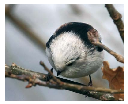
375 Central European Long-tailed Bushtit / Staartmees Aegithalos caudatus europaeus, Stuw Hankate Hellendoorn, Overijssel, Netherlands, 28 March 2008. Intermediate bird. Note brownish spot on neck-side and scattered darker spots on crown and nape.

The 15 well-documented records of caudatus in the Netherlands (table 1) indicate that this taxon might be rarer in north-western Europe than generally thought (cf Voous 1968, 1972). The extremely small number of reports in Belgium and Britain seems to confirm this. On the other hand, due to increased observer awareness and better documentation, which may in part be a result of the onset of our research, caudatus has been recorded annually in the Netherlands since 2002. In the past, the Dutch rarities committee (CDNA) did not consider caudatus as it was assumed to occur too often; its occurrence is given as 'irregular and extremely scarce' by Bijlsma et al (2001). There is a number of reasons why its occurrence may have been overestimated in the past: