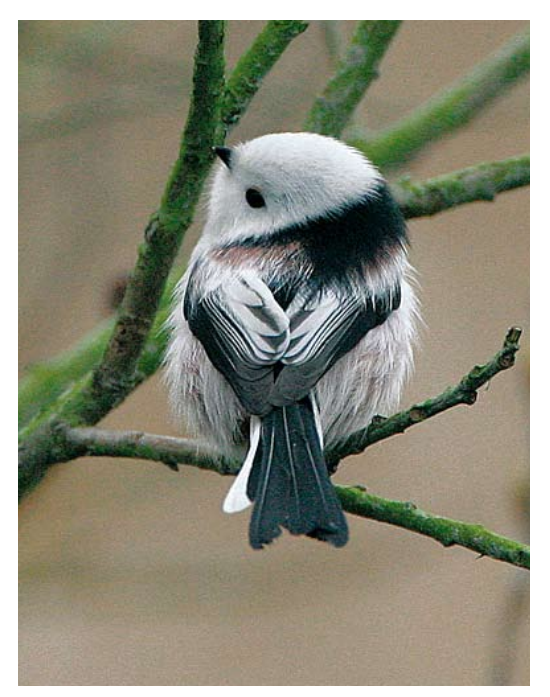
365 White-headed Long-tailed Bushtit / Witkopstaartmees Aegithalos caudatus caudatus , Makkum, Friesland, Netherlands, 29 November 2003 ( Bas van den Boo gaard )

variably coloured. According to Cramp & Perrins (1993), 'sibiricus' has whiter tertials than caudatus . However, many caudatus from Fennoscandia also show much white on the tertials. It can be concluded that the amount of white on the tertials is not a reliable feature in itself but can be used as a supportive character.