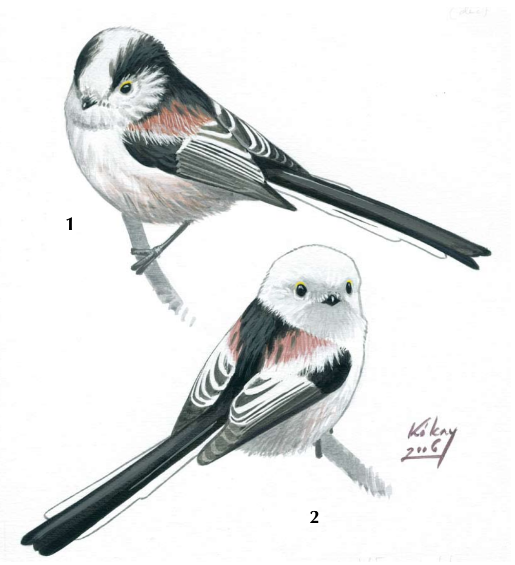
FIGURE 1 Long-tailed Bushtits / Staartmezen Aegithalos caudatus (Szabolcs Kókay) . 1 europaeus , 2 caudatus . Both birds closely matching description of type specimens of both subspecies.

FIGURE 2 Central European Long-tailed Bushtits / Staartmezen Aegithalos caudatus europaeus (Szabolcs Kókay). 1 note faint band running from forehead over eye and nape. 2 note scattered darker feathers on head and not sharply defined neck-band. 3 note some dark feathers on nape and clearly visible indication of breast-band. Tertials in this bird showing prominent white outer web. 4 typical europaeus but lacking breast-band and showing dark streak on flank. 5 note small darkish spot above eye, otherwise strongly matching caudatus in plumage. 6 bird showing some brownish feathers at edge of neck-band rather than black feathers, rendering neck-band not sharply defined. Tertials in this bird showing prominent dark inner web.